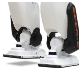
REEM-C balancing on one leg between steps

The controller's goal is to adjust the robot's centre of mass (CoM) position to always maintain the ZMP point inside of the support region (under the feet). Successful biped dynamic walking requires precise control of the legs' joint angles in terms of position, velocity and acceleration via rotary encoder feedback.