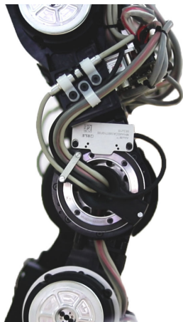
REEM-C knee joint with AksIM™ absolute rotary encoder system

RLS non-contact magnetic encoders were chosen as the solution. These included rotary encoders such as AksIM™ and Orbis™ which are integrated into knee (pictured above), wrist and elbow joints and the component-level incremental RoLin™ system.