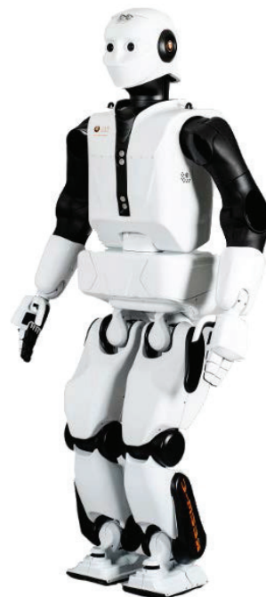
PAL Robotics' full-size biped humanoid robot REEM-C

The design, programming and assembly of the robots all takes place in PAL Robotics' bustling Barcelona offices where a team of engineers work to constantly advance the capabilities of their robots.